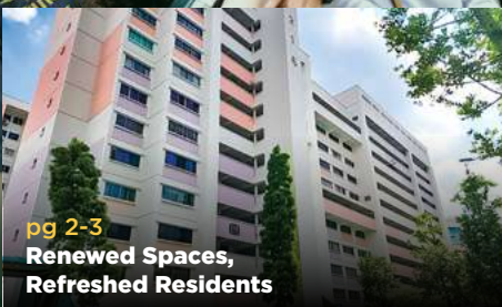
pg 2-3 Renewed Spaces, Refreshed Residents