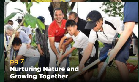
pg 7 Nurturing Nature and Growing Together