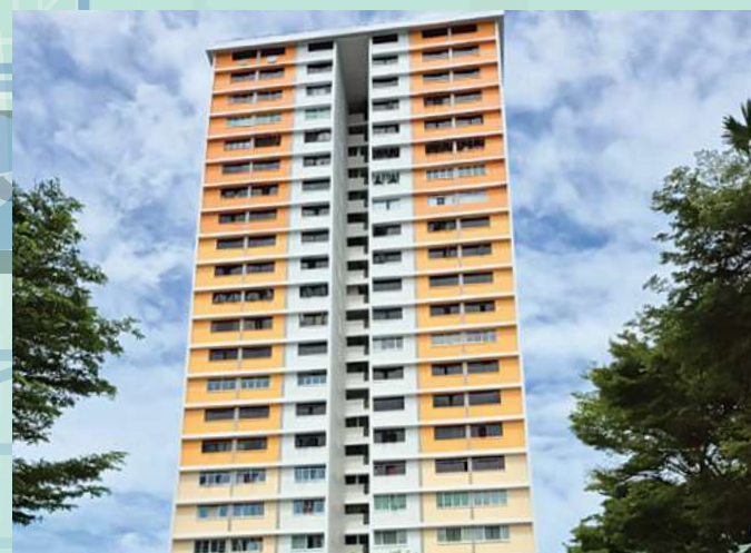
▲ Blks 7-15 Ghim Moh Rd (Ghim Moh Garden)