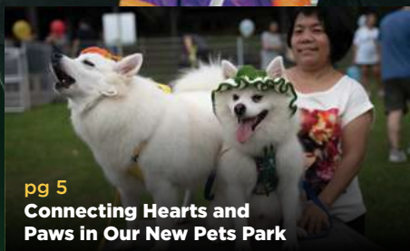
pg 5 Connecting Hearts and Paws in Our New Pets Park