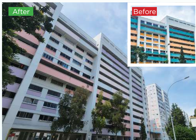
▲ Blks 201-233 Petir/Pending Rd