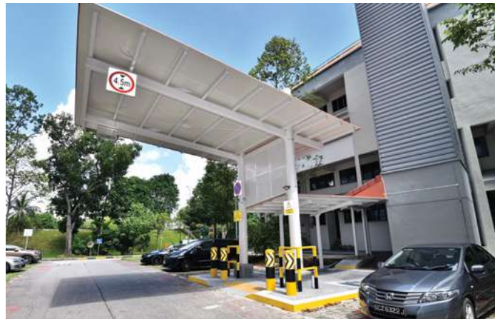
▲ Drop-Off Porch at Blk 104 Clementi St 14