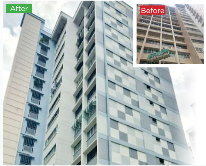
▲ Blks 201-206 Clementi Ave 6