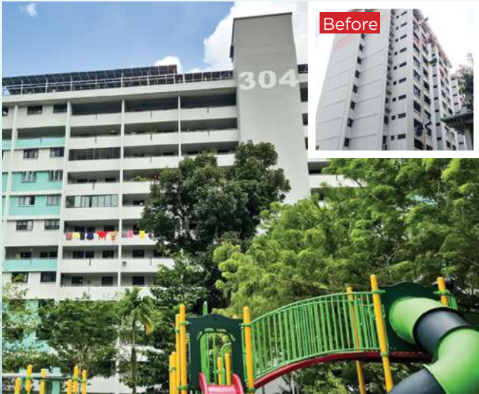
▲ Blks 301-310 Clementi Ave 4