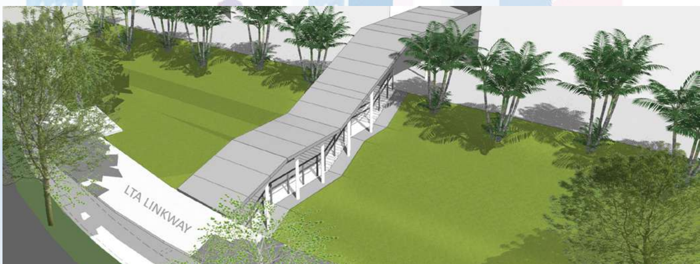
▲ Proposed Covered Linkway over Existing Staircase at Blk 607 Senja Rd