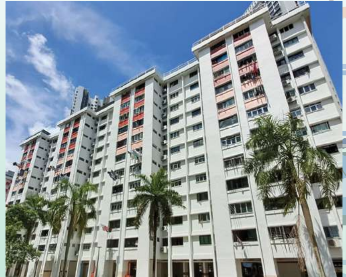
▲ Blks 315-320 Clementi Ave 4