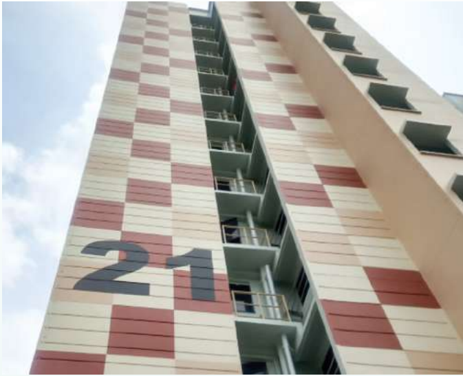
▲ Blk 21 Toh Yi Dr