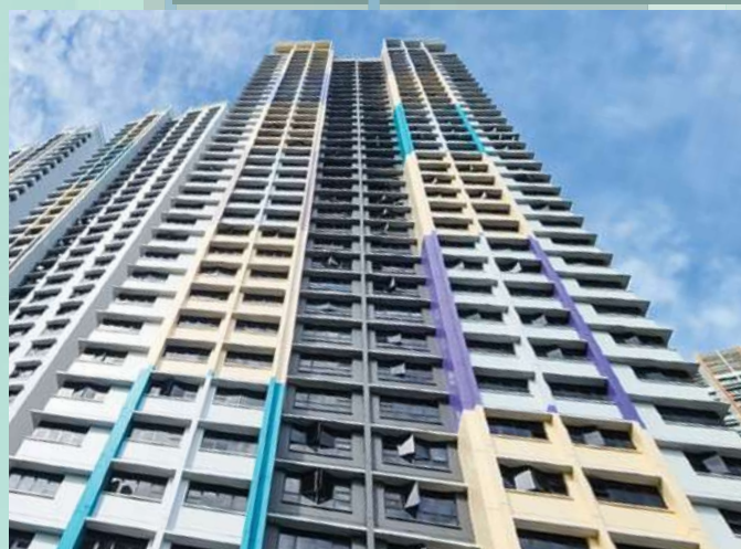
▲ Blks 29-33 Ghim Moh Link (Ghim Moh Edge)