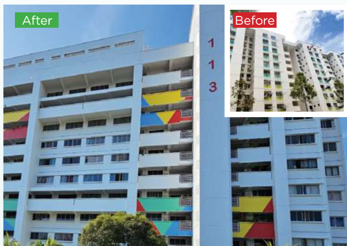
▲ Blks 101-129 Gangsa Rd