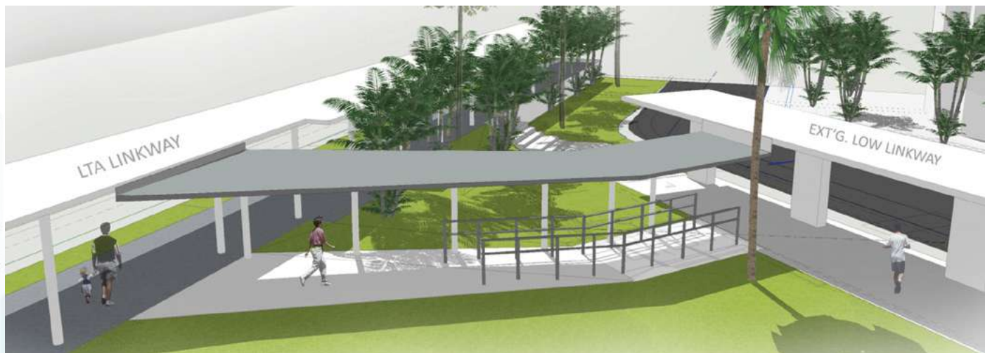
▲ Proposed Covered Linkway over Existing BFA Ramp at Blk 182 Jelebu Rd