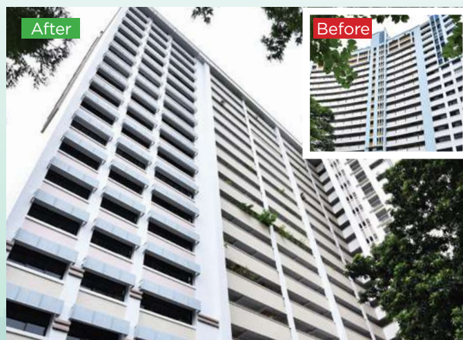
▲ Blks 613-624 Bukit Panjang Ring Rd/Senja Rd