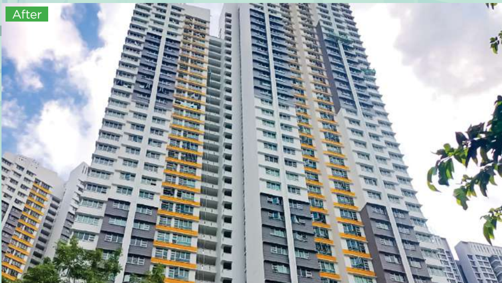
▲ Blks 312A-D Clementi Ave 4 (Clementi Ridges)