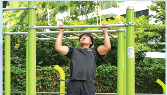
▲ Adult Fitness Corner at Blk 8 Empress Rd

Through strategic upgrades, HBPTC improves the physical environment while building a stronger and more interconnected community.