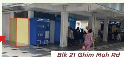
Blk 21 Ghim Moh Rd