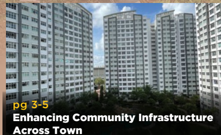
pg 3-5 Enhancing Community Infrastructure Across Town