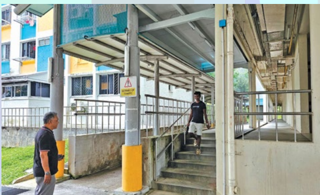
▲ Blk 213 Petir Rd