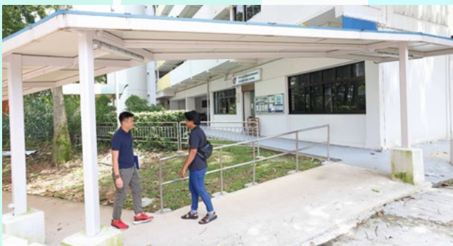
▲ Blk 6 Ghin Moh Rd to Ulu Pandan Community Centre