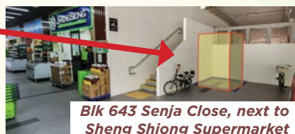
Blk 643 Senja Close, next to Sheng Shiong Supermarket

In efforts to promote eco-conscious habits and reduce textile waste, Holland-Bukit Panjang Town Council is bringing more Cloop bins closer to residents. It is now easier than ever to contribute to a sustainable environment.