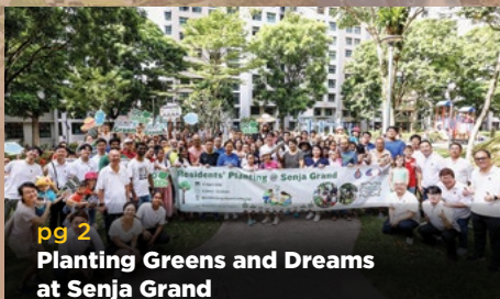
pg 2 Planting Greens and Dreams at Senja Grand