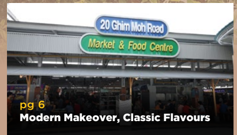
pg 6 Modern Makeover, Classic Flavours