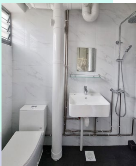
◀ Toilet upgrades with larger wall and floor tiles, and better quality sanitary fittings

In addition to these essential works, residents opted for enhancements to toilets, doors, gates and refuse chute hoppers.