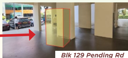
Blk 129 Pending Rd