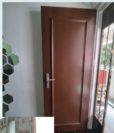
◀ Wrought iron grill gate or mild steel entrance gate with interior thumb-turn knob