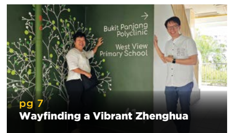
pg 7 Wayfinding a Vibrant Zhenghua