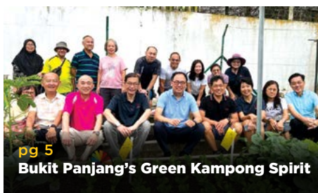
pg 5 Bukit Panjang's Green Kampong Spirit