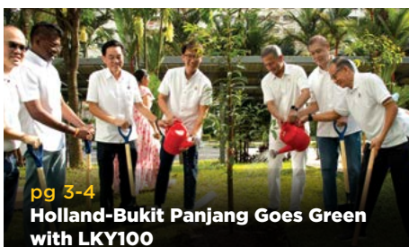
pg 3-4 Holland-Bukit Panjang Goes Green with LKY100