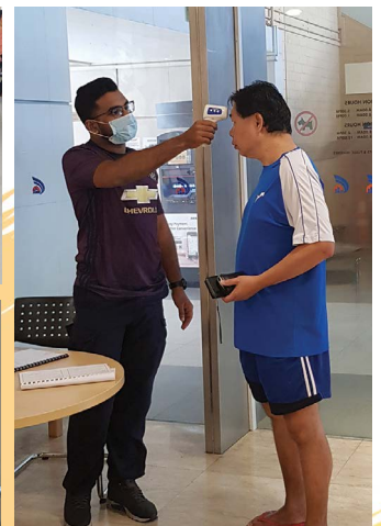
Temperature screening station at Holland-Bukit Panjang Town council office