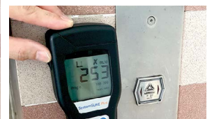
Bacteria levels before (top) and after (bottom)